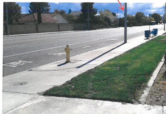
Existing hydrant to remain in place