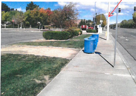
Existing bus stop looking north