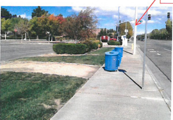
Existing bus stop looking north