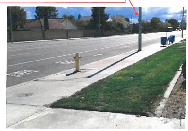
Existing hydrant to remain in place