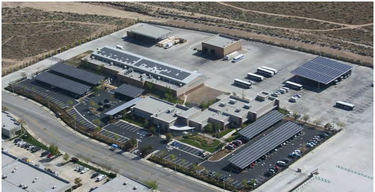
AVTA's Operations and Maintenance Headquarters, Lancaster, CA